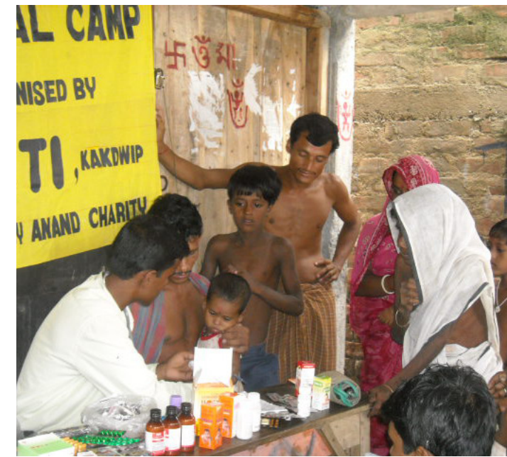
Images: Left: Family affected by the hurricane Top right: Medical camp Bottom right: Provision of materials

While we were able to help a few of those that were impacted, there are many more who still need our help.