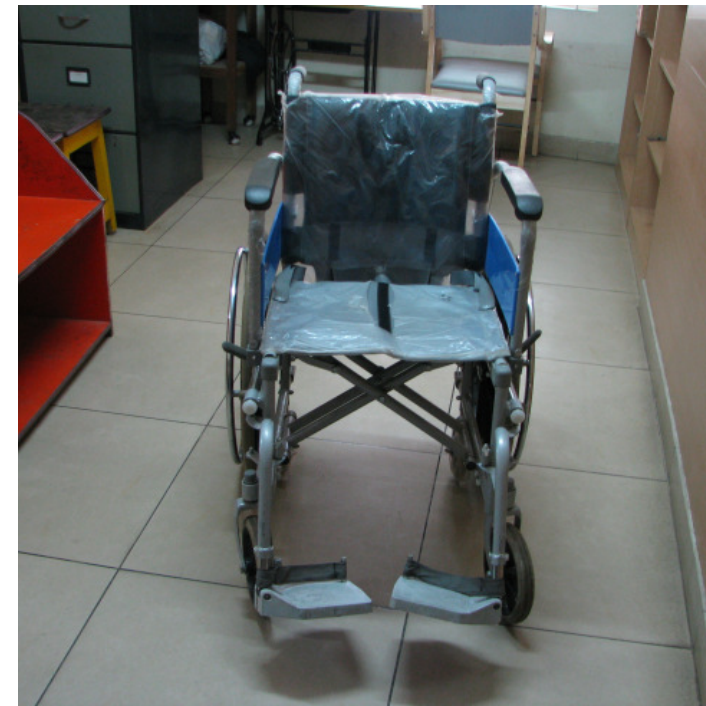
Images: Left: Specially designed chairs in use Right: Pictures of the wheelchairs

Anand Charity teamed up with ASHA Chennai to execute this project. A total of 35 chairs (5 wheel chairs and 30 specially designed chairs) were bought for FAME.